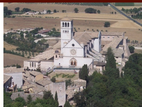
Basilica of St. Francis Assisi

As we will learn about in our travels, many of the saints led ordinary lives, and we can relate to their struggles, triumphs, and prayer life. While our focus is "in the footsteps of the saints," let us also reflect on their humanity and how their unique traits ultimately brought them closer to God.