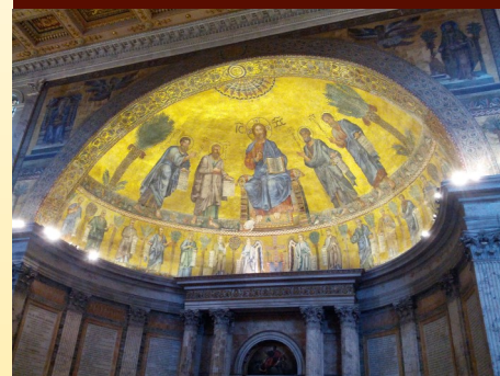
St. Paul Outside the Walls Rome