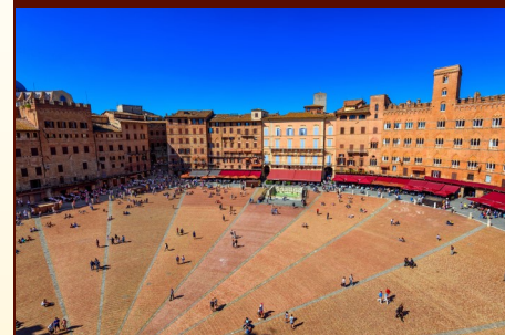
Piazza del Campo Siena