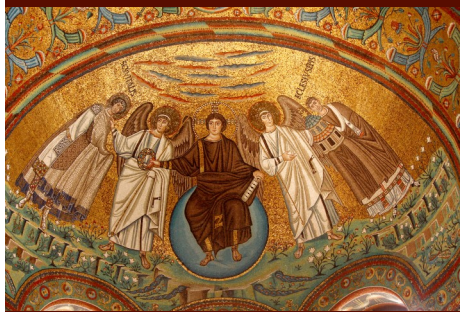
Basilica of San Vitale Ravenna