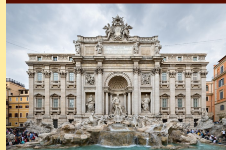
Trevi Fountain Rome