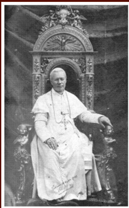
St. Pius X 1835-1914