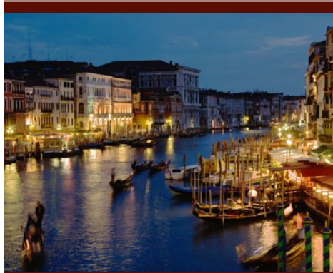
Grand Canal Venice