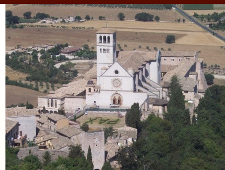
Basilica of St. Francis Assisi

Though too soon, your Italian adventure has come to an end. Private motorcoach will be provided to Roma Fiumicino Airport for your flight to home.