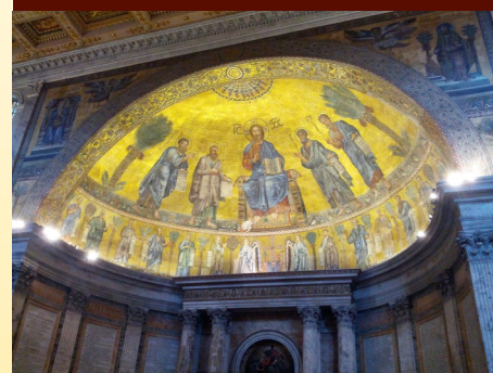
St. Paul Outside the Walls Rome